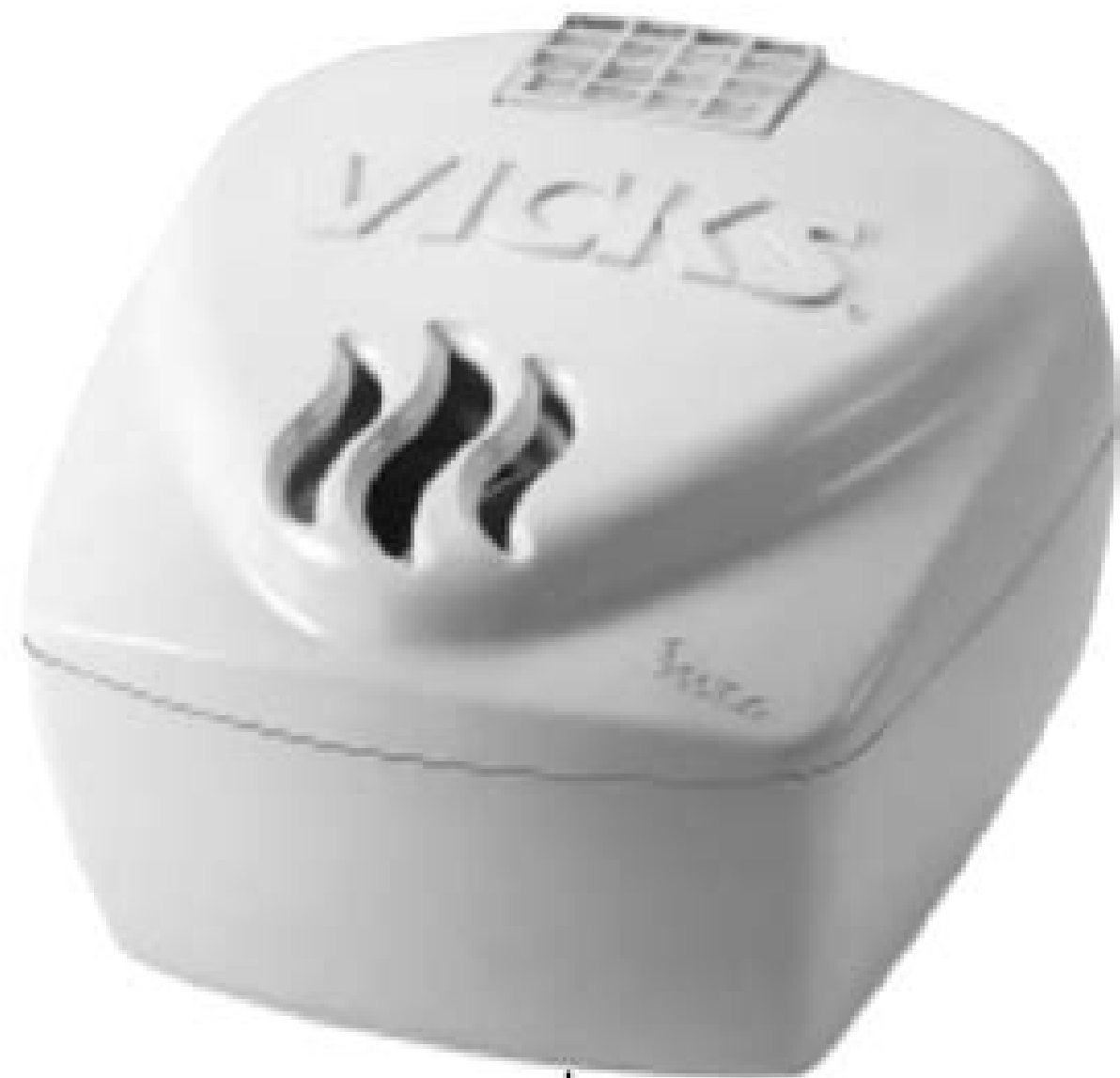
Vicks v4500 humidifier manual.